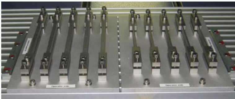
Universal base plates 201-124 and 201-125