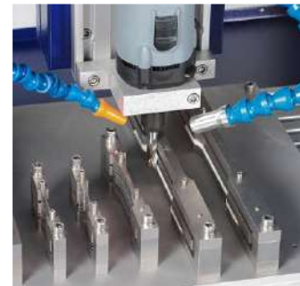
Milling cutter with cooling unit