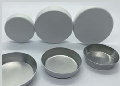
SO-S40P Back side painted