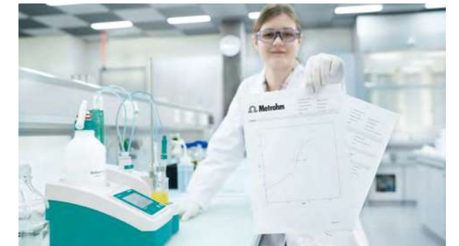
→ Obtain a GLP compliant report