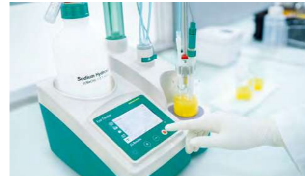
→ Enter the sample data and start the titration