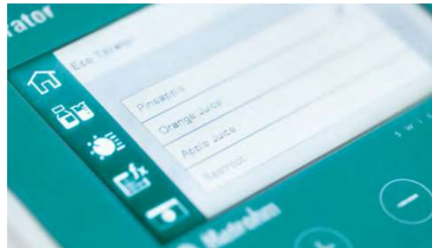
→ Select method

Once your applications are saved on the device, working with the Eco Titrator could not be any easier: Press a few keys and what you get is an accurate, reproducible result for your sample. Depending on your requirements, save a GLP compliant report as a PDF file or send it to printer.