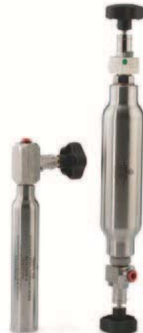
20470-5 and 21650-5 Sampling Cylinders