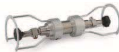
A double valve cylinder fitted with 21502-2 collars