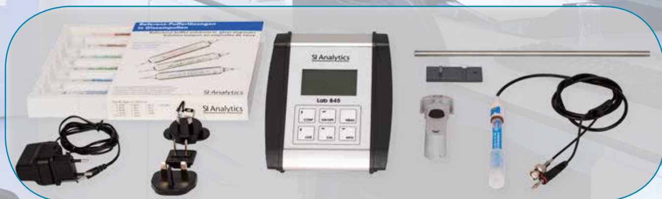
Lab 845 Set