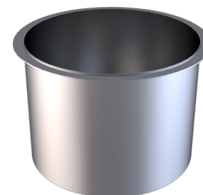
Cryogenic Processor Inner Bowl, 5 L