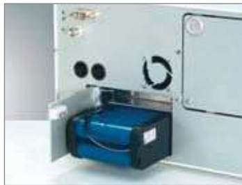
24 V/DC battery