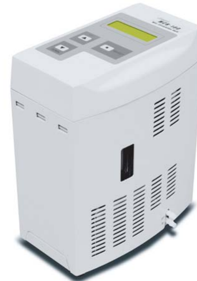
MCB-100 MCB-100 Mini Water Circulation Bath