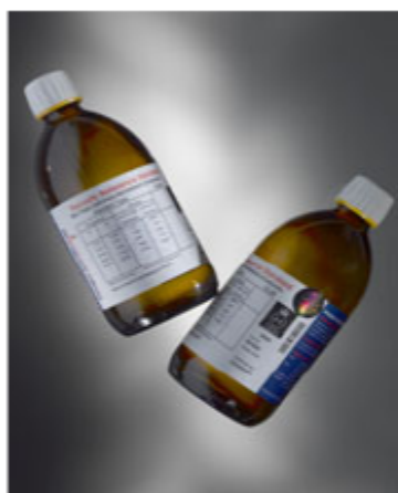
High Temperature Type S3S