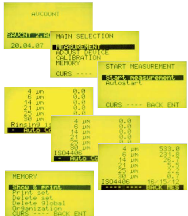
AUTOMATIC OPERATION & EASY TO FOLLOW MENU SYSTEM