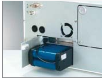
24 V/DC battery