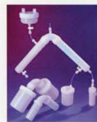
▶ Sub-boiling Stills