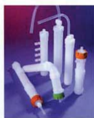
▶ Column Components