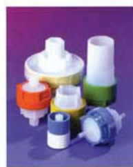
▶ Inline Filter Holders