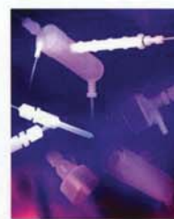
▶ ICP/ICP - MS

Over 1,000 standard PFA products on the market today.