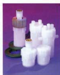
▶ Digestion Vessels