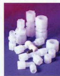
▶ PFA Fittings