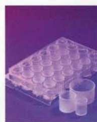
▶ Drop-in Wells