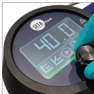
Select test temperature